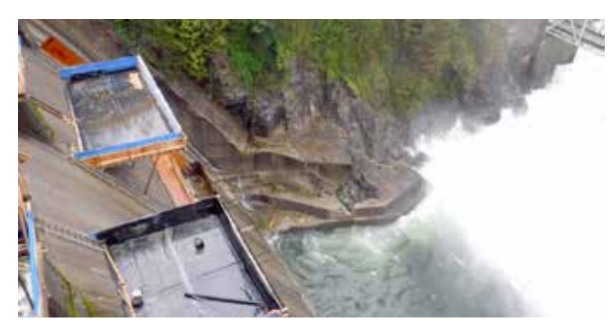
Ruskin Hydroelectric Dam in Canada.

Dynamic Isolation Systems developed a system which provides isolation from damaging accelerations in both horizontal (X, Y) and vertical (Z) directions.